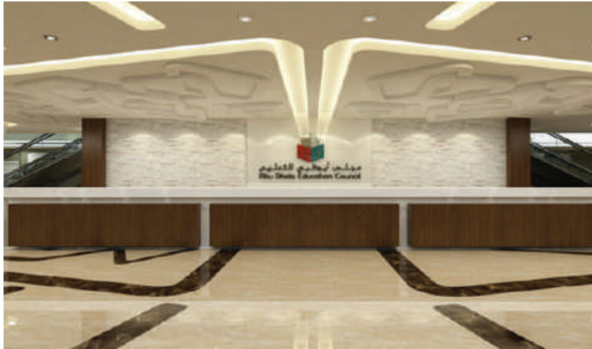
ABU DHABI EDUCATIONAL COUNCIL