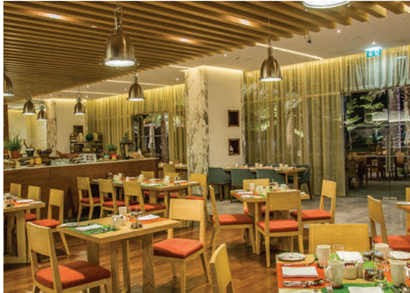
Double Tree By Hilton

Salim & Sons Group is considered to be a leading Furniture Factory in the UAE