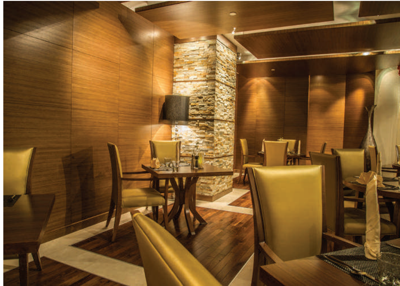
Auris Plaza Hotel

Fit out works is such an interesting type of work that Rococo specialized Fit-out team execute with such a joy and extreme excitement.