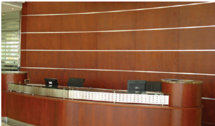
SEARTRUCK OFFICES DUBAI